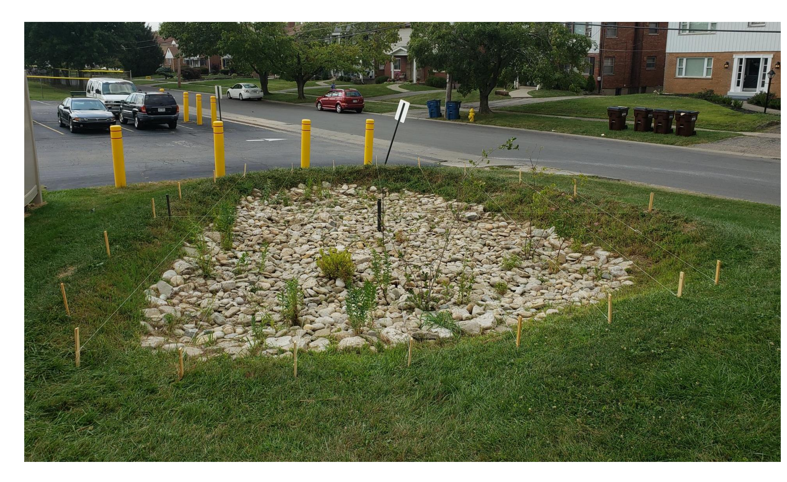
Fig. 1 The Deer Park High School rain garden. Stakes were placed around the perimeter and across the rain garden to create 8 transects. White string was attached to the transect stakes so the string remained at a common elevation from which students could measure.

This initial effort laid the foundation to develop additional physical science curriculum materials linked to the rain garden including hydrogeologic skills such as analysis of staff gauge data, rain gauge data, and soil percolation tests.