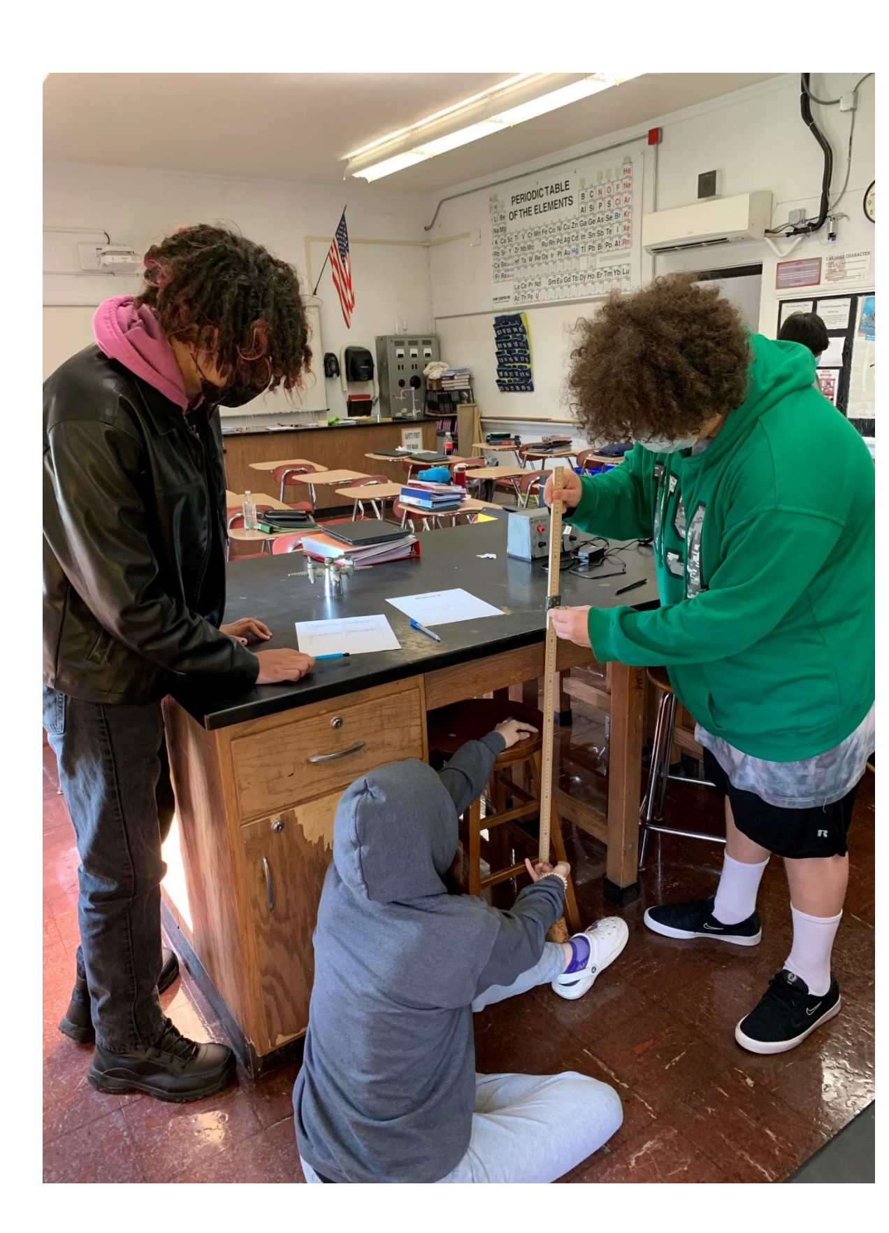
Fig. 2 Students practicing the modified surveying procedure using meter sticks and bubble levels.

The students were tasked with determining how much water the rain garden could capture and divert from nearby storm drains. They were introduced to surveying and practiced a modified surveying method in the classroom using metersticks and bubble levels. The next day the classes conducted an elevation survey for a reference grid established within the rain garden.