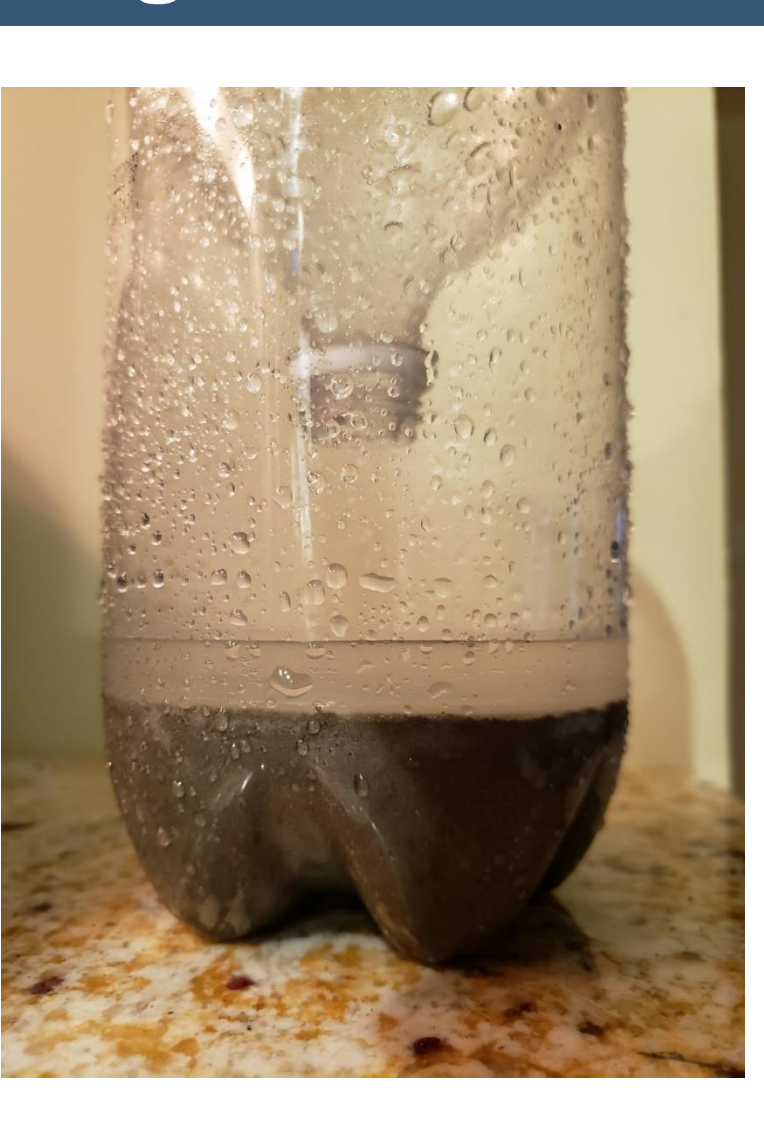
Fig. 6 Soda bottle rain gauge with collected rainfall. Gauges were constructed with 21 bottles, cement, and sealer.

This spring, DPHS students are collecting rainfall data using soda bottle rain gauges to answer research questions related to rainfall distribution and rain gauge design. Students will process the data late this school year.