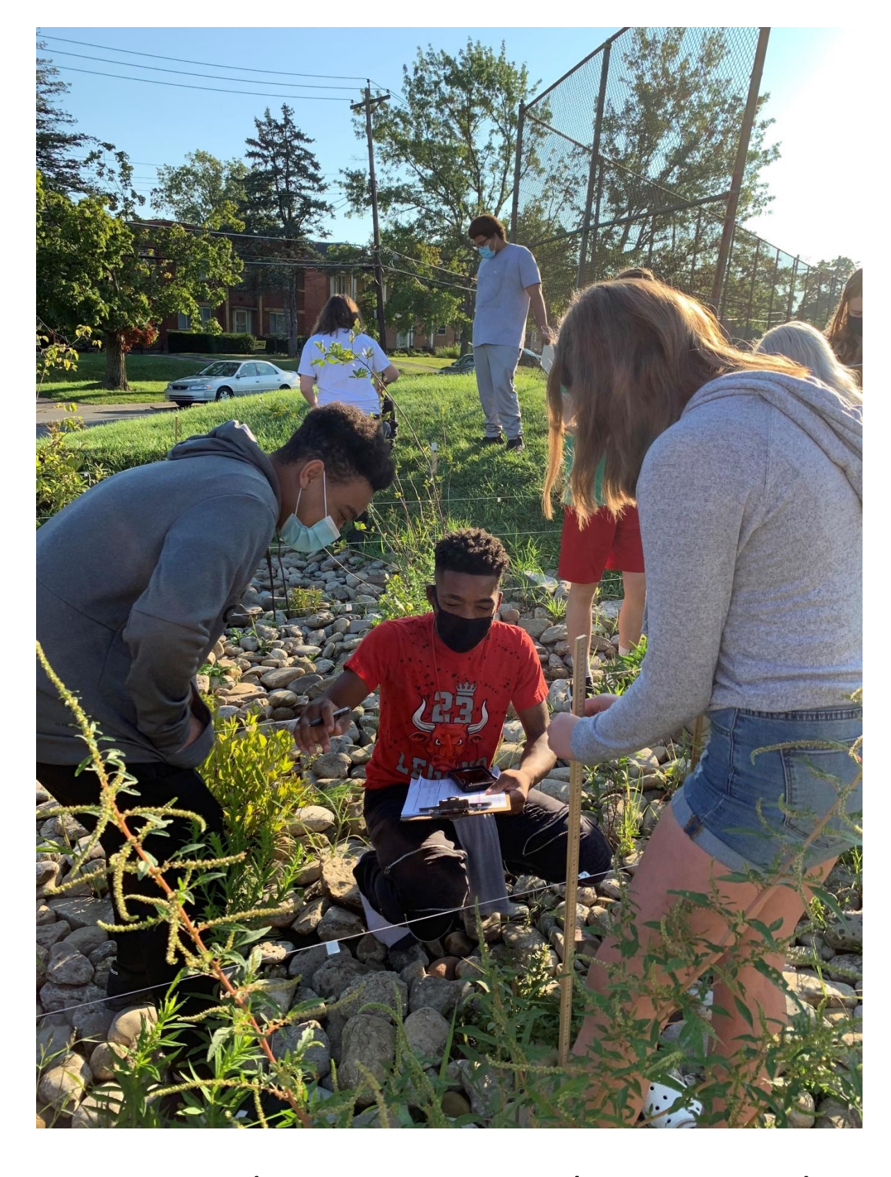
Fig. 3 Students surveying the rain garden. Measurements were taken from the ground up to the string that was at a consistent height across the rain garden.