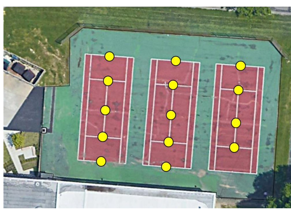
Fig. 7 Deployment map of the soda bottle rain gauges on the tennis courts near the DPHS rain garden.